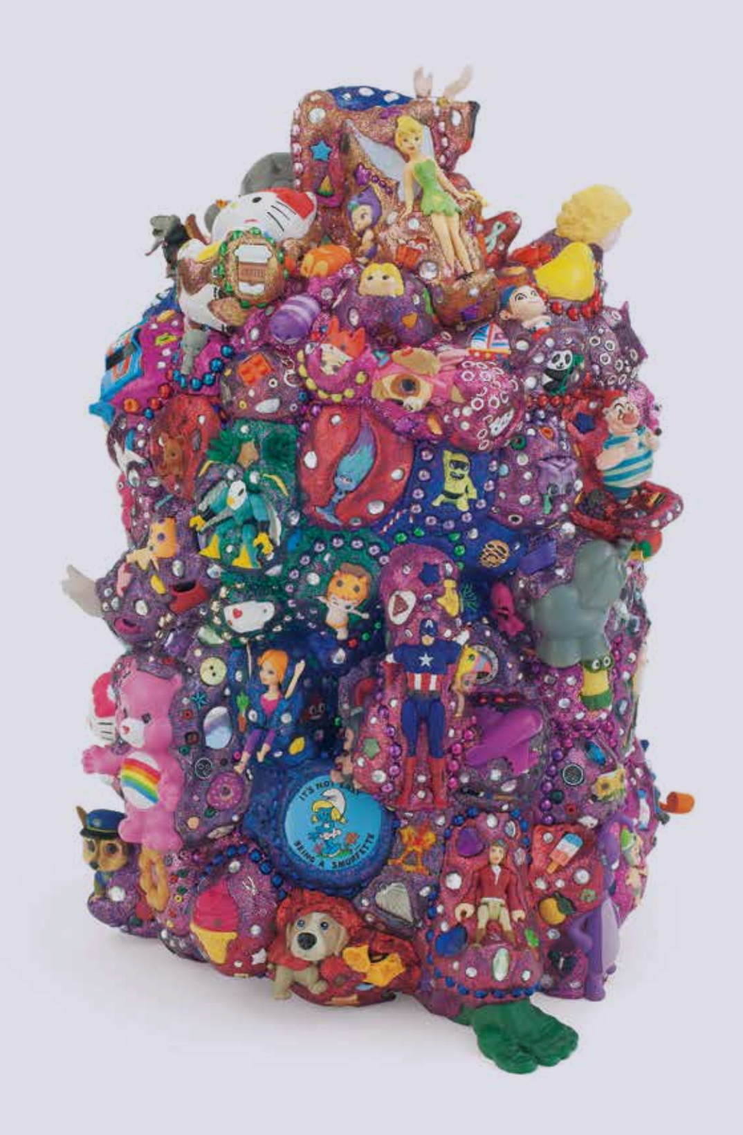
ani hoover forget-me-not